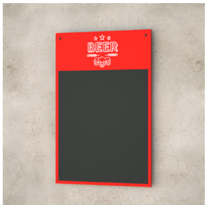
Product index: BOARD.5250

Board dimensions: 400 x 500mm 500 x 700mm Minimum order quantity: 10pcs.