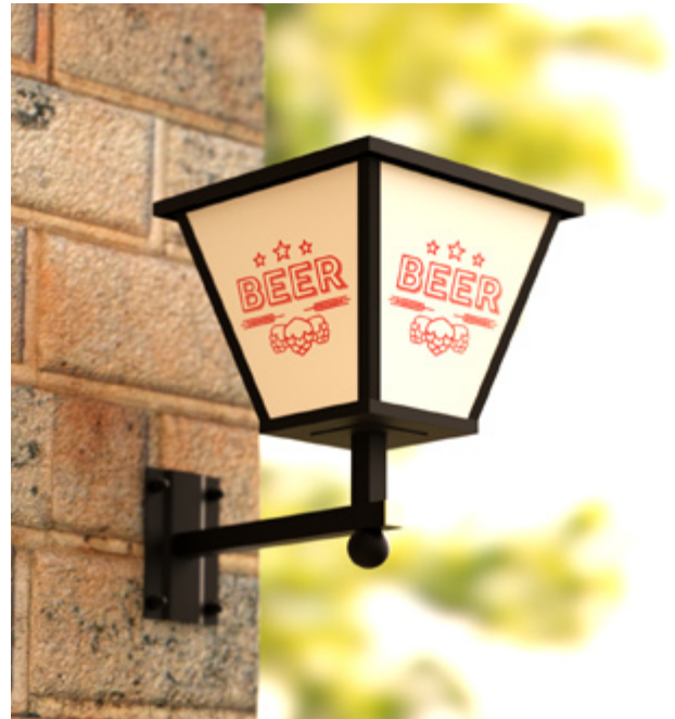
Product index: LANT.6070

Lampshade dimensions: 280 x 290mm Total size with wall mount: 380 x 290mm Minimum order quantity: 10pcs.