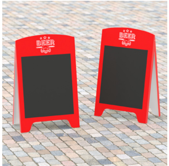
Product index: BOARD.5203

Dimensions: 980 x 550mm Minimum order quantity: 10pcs.