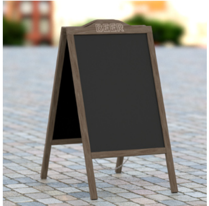
Product index: BOARD.5202

Dimensions: 610 x 1180mm Board dimensions: 530 x 800mm Bar width: 40mm Weight: ~6kg Minimum order quantity: 10pcs.