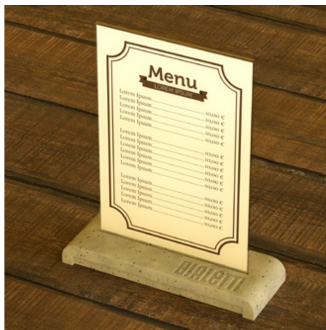
Product index: BETO.004

Quantity per pallet: 240pcs. Pallet size: 600 x 800mm Minimum order quantity: 10pcs.