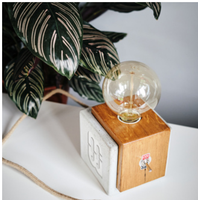
Product index: LAMP.003

Quantity per pallet: 100pcs. Pallet size: 600 x 800mm Minimum order quantity: 10pcs.