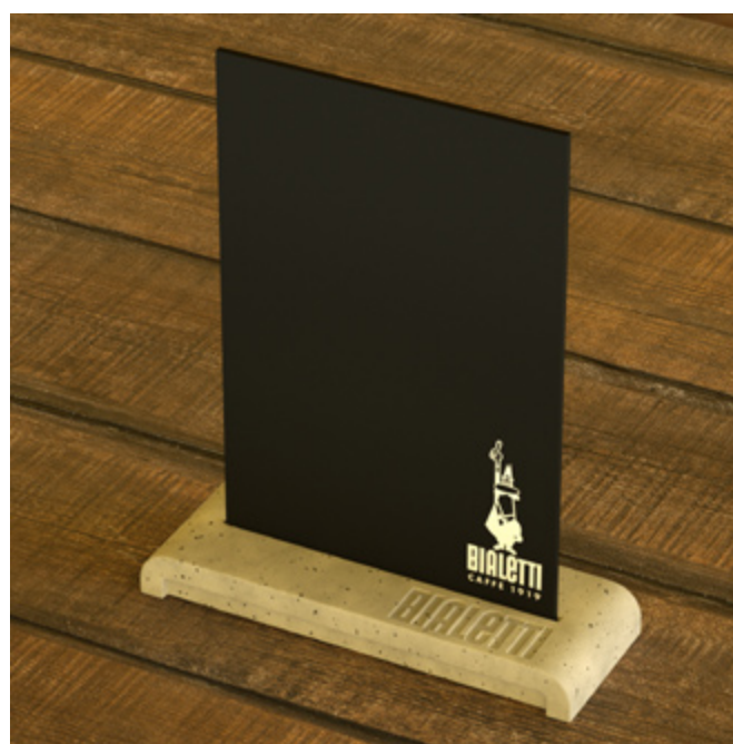
Product index: BETO.005

Quantity per pallet: 240pcs. Pallet size: 600 x 800mm Minimum order quantity: 10pcs.