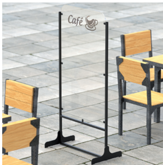
Product index: COVE.001

Screen height: 1500mm Screen width: 700mm Minimum order quantity: 5pcs.