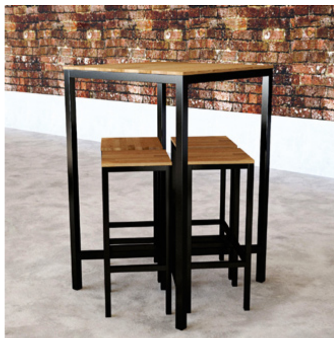
Product index: SETO.001

Table height: ~1000mm Tabletop size: 700 x 700mm Seat height: 700mm Seat size: 300 x 300mm Minimum order quantity: 4 sets