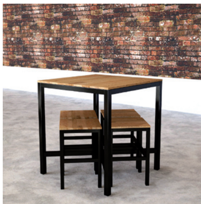
Product index: SETO.002

Table height: ~750mm Tabletop size: 700 x 700mm Seat height: 450mm Seat size: 300 x 300mm Minimum order quantity: 4 sets