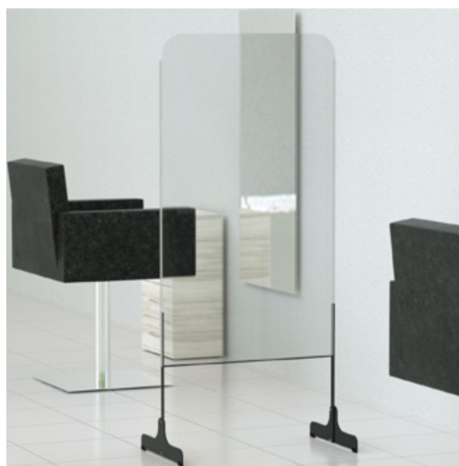
Product index: COVE.002

Screen height: 1600mm or 1800mm Screen width: 700mm Glass height: 1255mm or 1455mm Minimum order quantity: 5pcs.